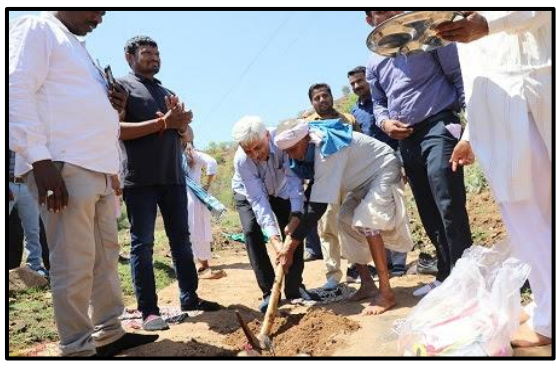
VSSM launching Lake Desilting Work at Mama Pipla after Bhoomi Pujan Ceremony