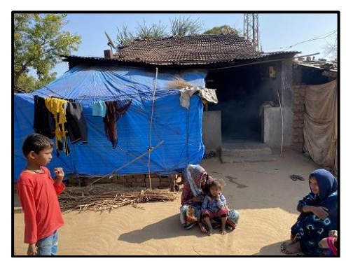
The current living of nomadic families

The Raval community of Pandva village earns their living through agriculture or small-scale independent ventures. We offered to support them in whatever way they deemed possible. The community members share a great bond we pray for their continued harmony and well-being.