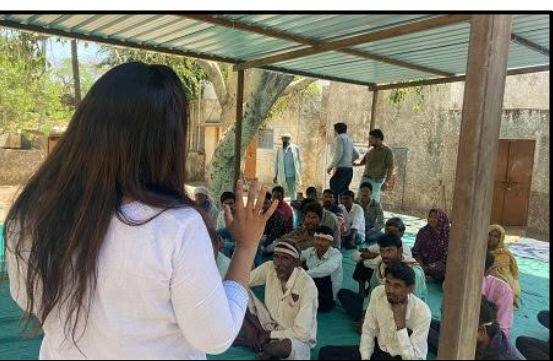
Mittalben in discussing with the Community