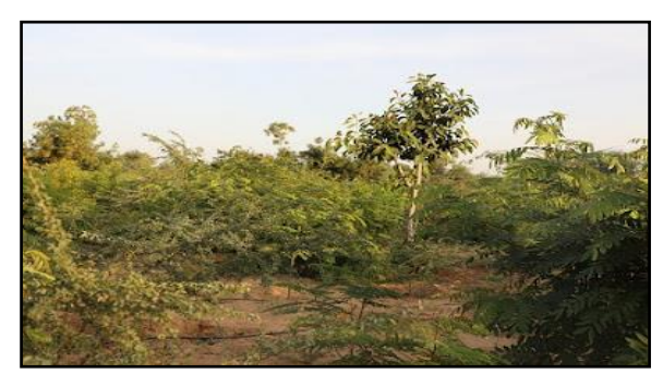
VSSM planted 3500 trees and almost all of them have taken roots and flourished.

If one isn't aware of our work, such an invite to visit a crematorium can create a stir. But the community leaders of Ramsan village were inviting us out of their love, to showcase the beautiful place it had become.